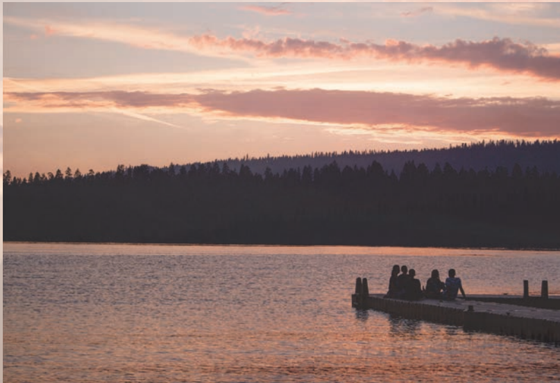
Payette Lake. Camp Ida-Haven.